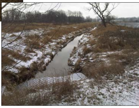
After Bottom Cleanout