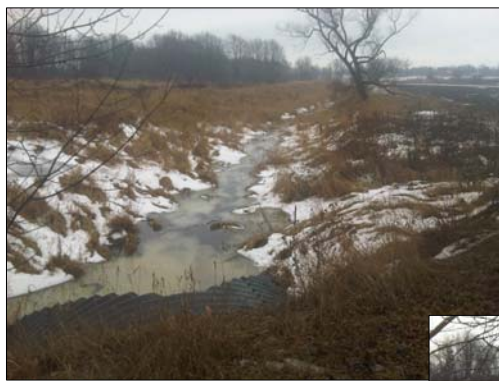
Before Bottom Cleanout